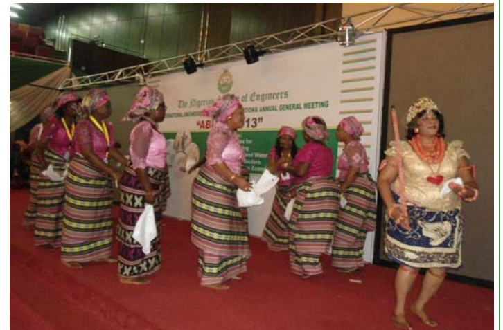
NSE PH Branch Spouses performing on stage during the Cultural Nite that was held on Wednesday 11th December 2013.