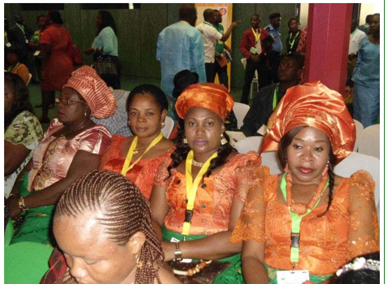
Some NSE PH Branch spouses at the Opening Ceremony of the conference on Tuesday 10th December 2013.